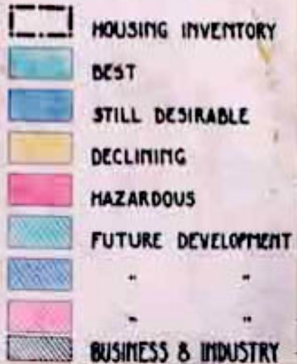
"Home Owners' Loan Corporation Philadelphia redlining map". Licensed under Public Domain via Wikipedia - https://en.wikipedia.org/wiki/File:Home_Owners%27_Loan_Corporation_Philadelphia_redlining_map.jpg#/media/File:Home_Owners%27_Loan_Corporation_Philadelphia_redlining_map.jpg